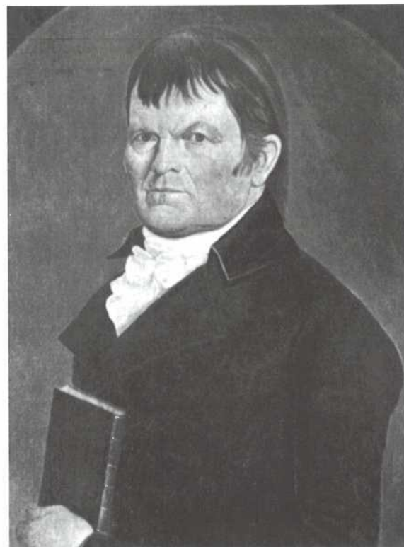
The Henry Sheldon Museum of Vermont History