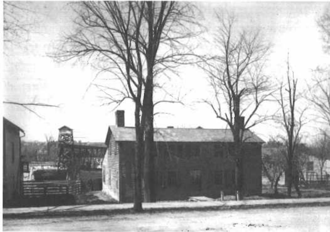
The Henry Sheldon Museum of Vermont History