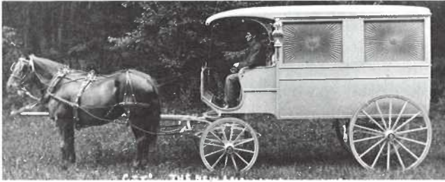
Barre's ambulance, circa 1900

In recent years medical research has helped scientists make breakthroughs in our understanding of disease and its cure. Many ailments that contributed to our ancestors' high death rate, such as small pox, diphtheria, tuberculosis, and poliomyelitis are now almost entirely wiped out in this country. Our life span is practically double that of one hundred years ago.